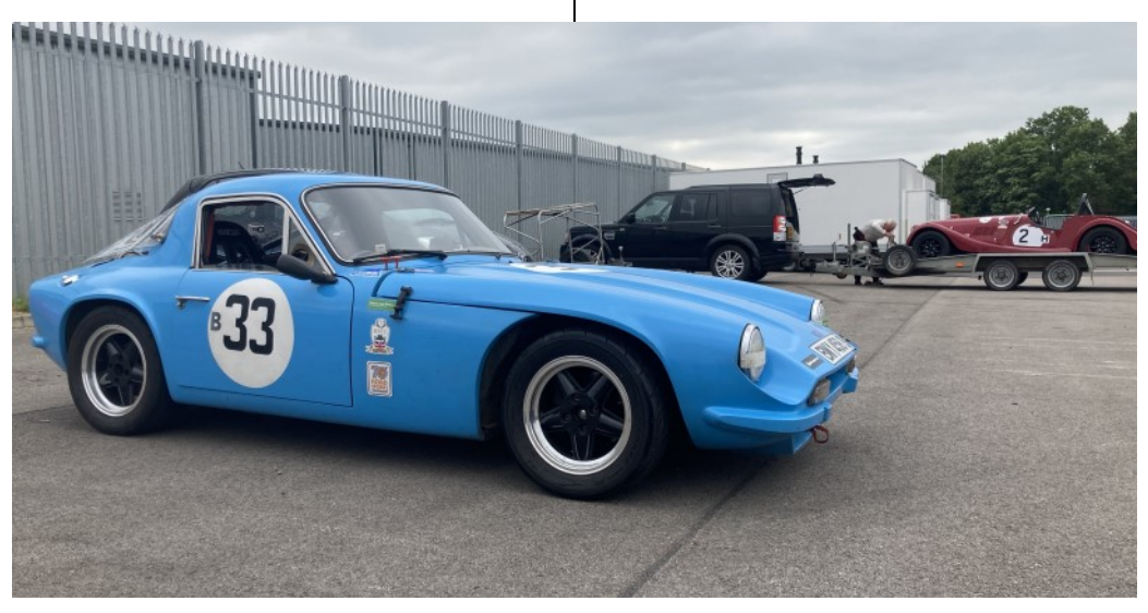
Ready to race. With a 7 hour gap there was plenty of time to fettle.

With coolant everywhere, including running out the right hand exhaust, every