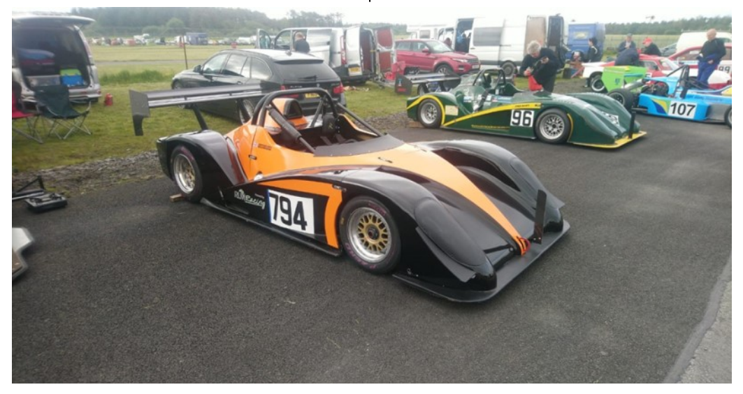
Not apparent at the time but tyre graining was about to become an issue.

Before the event, what was supposed to be a short evening of checking the car over and changing the gearing highlighted that we had a badly stretched chain, which really needed replacing. At the time we thought this was reasonable as it had done a season on that chain, little were we to know what this was the beginning of! A quick call to B&C Express the next day and we had a new DID ZVM chain ready to fit which we duly did, with no dramas.