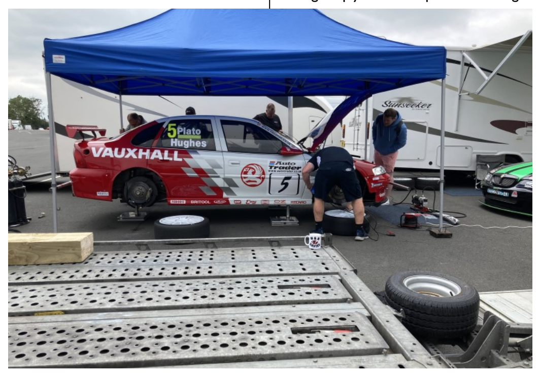
Classic Touring Cars bring in some great entries.

A quick inspection revealed water spitting out from the expansion tank looking simply like the cap wasn't sealing.