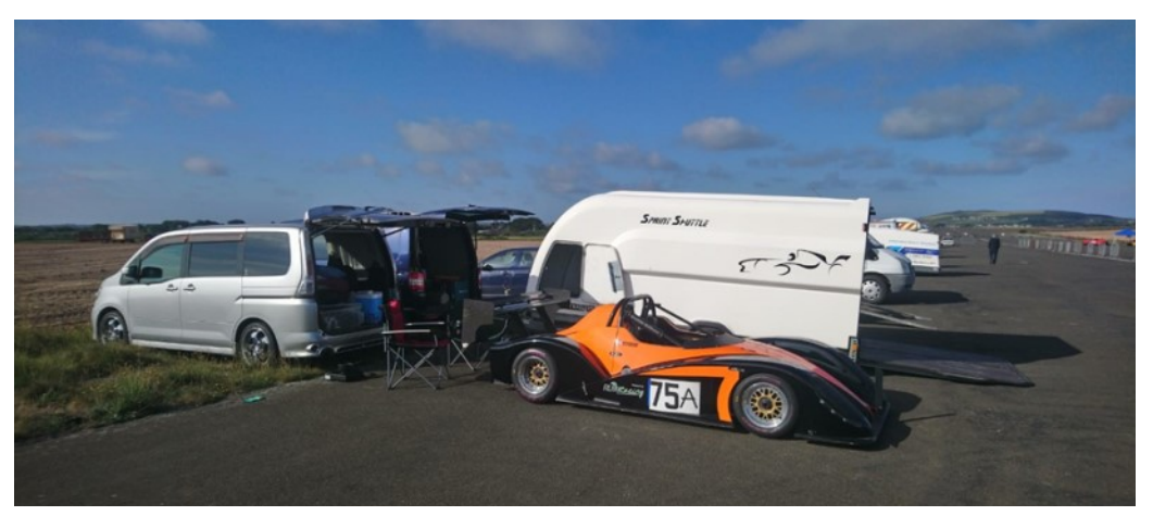
Greenslade and Clemow Radical ran well at Pembrey on both days.