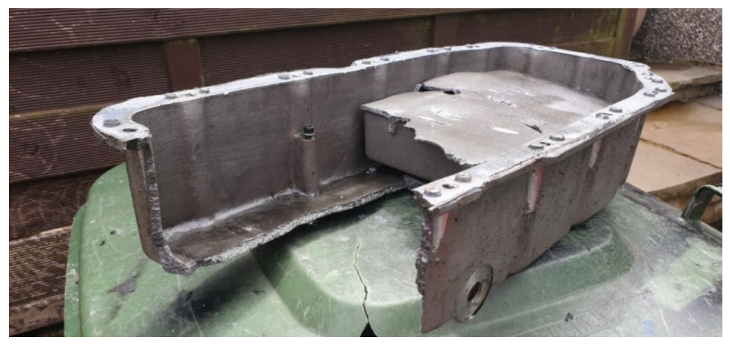
Just in case you thought 'half a sump' was an exaggeration

's been 15 months since the start of the Covid 19 pandemic and during the last 20 months I've managed to attend just 3 sprints and two track days the last of which was my first event of the season, The Pembrey Summer Sprint Weekend.