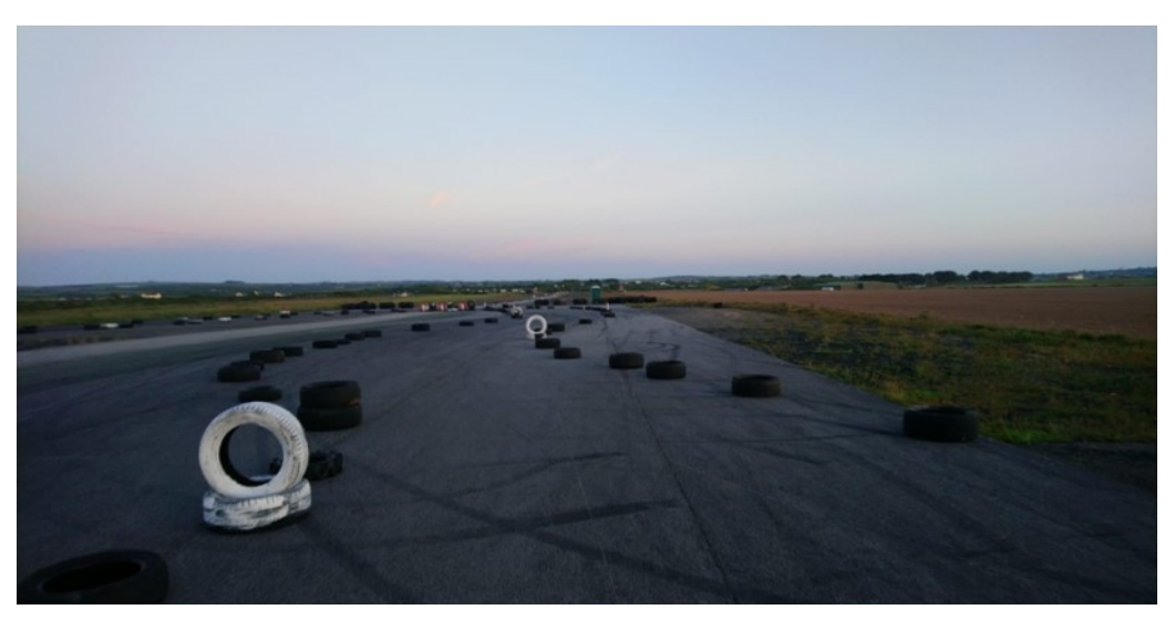
Perranporth Airfield proved to be the polar opposite of Pembrey. Bumpy too.

on the edge and going quickly we couldn't get close to the earlier times with Dave doing a 117.72 and myself a 114.98. A final T4 run left us going further backwards with a 115.8 and 116.3. We were feeling a bit despondent at getting slower all day.