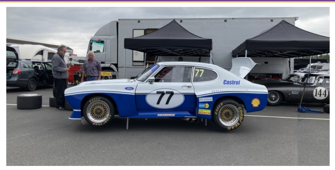
My second favourite car of the day (now that's loyalty).

indication was that the head gasket on that side had gone on the fresh for 2019 engine. Not good and no race that day.