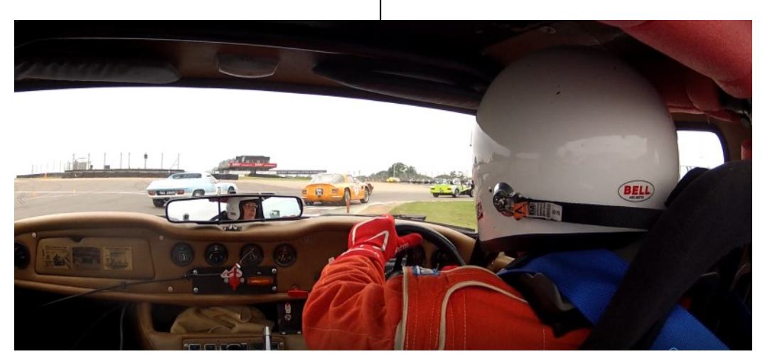
Rolling start. The lead cars at the front have just gone. Bye then..!

Hopefully I can confirm that in a future article. In the meantime a Ferrari 308 let go of all fluids causing mayhem on track and a re-start. Just 15 of the 22 finished in the end. Overall I enjoyed the day and