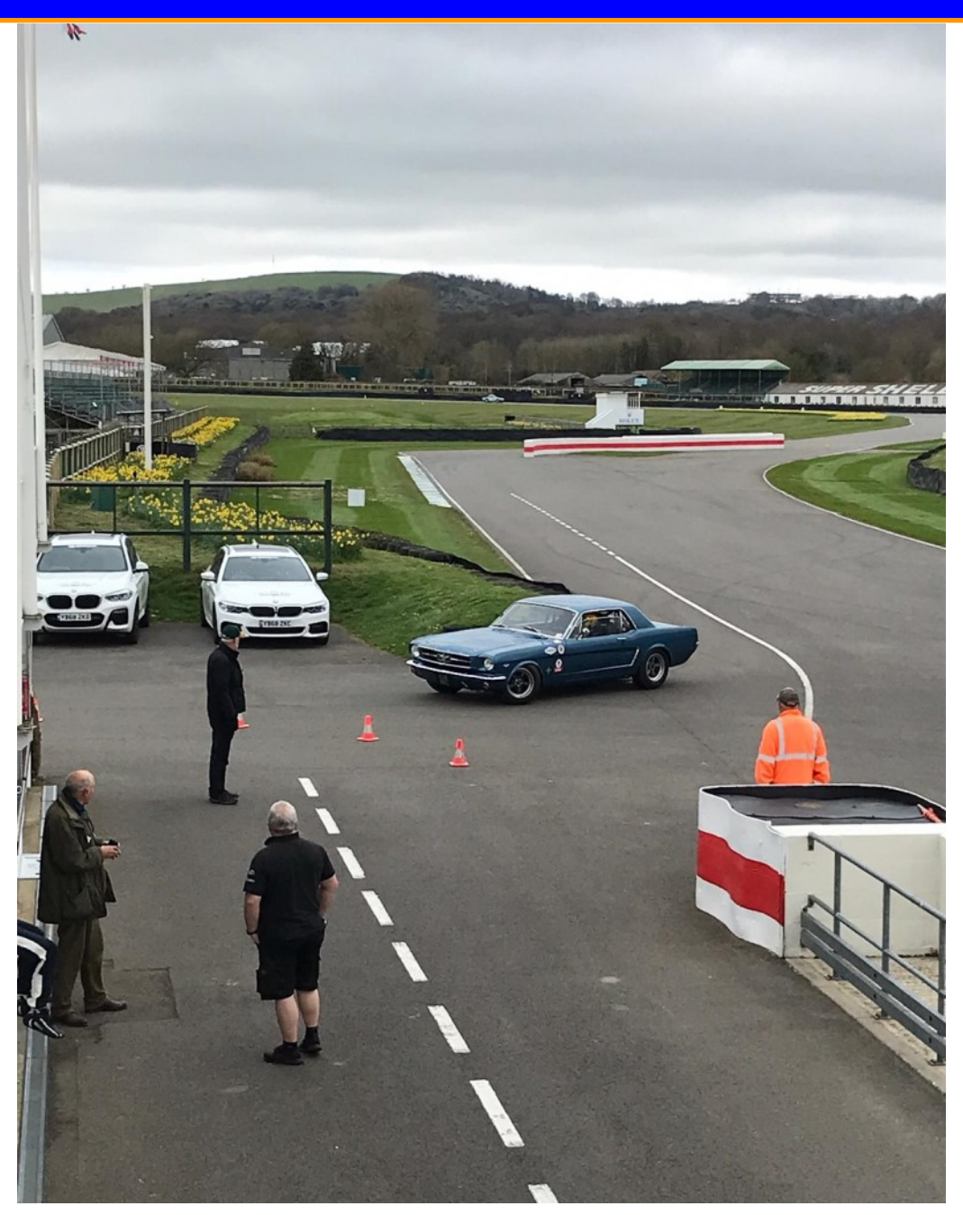
...and now