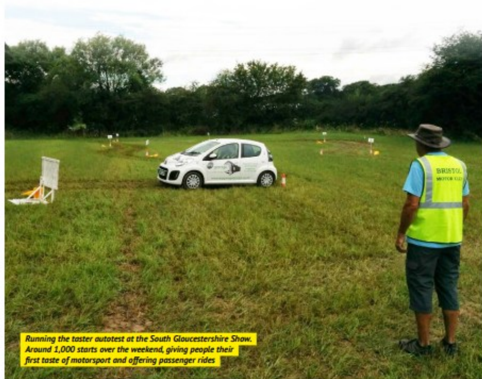
Running the taster autotest at the South Gloucestershire Show. Around 1,000 starts over the weekend, giving people their first taste of motorsport and offering passenger rides