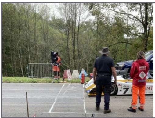
Start unusually 1m behind the beam